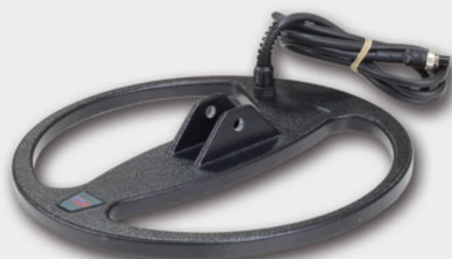
Search Coil (28cm (11"))