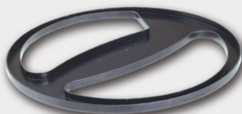
Search Coil Cover