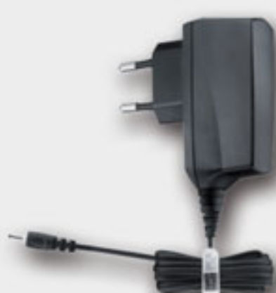
110/220V AC Charger