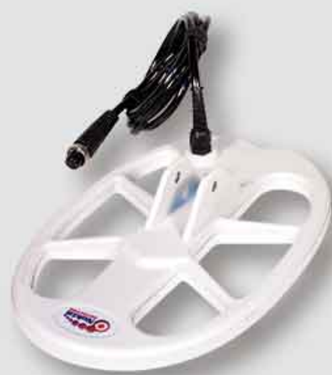
28.5 x 17.8 cm (11.2"x 7.0") DD Search Coil