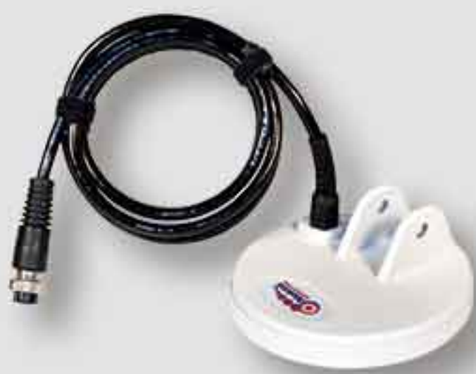
13.2 x 12.0 cm (5.2"x 4.7") DD Search Coil