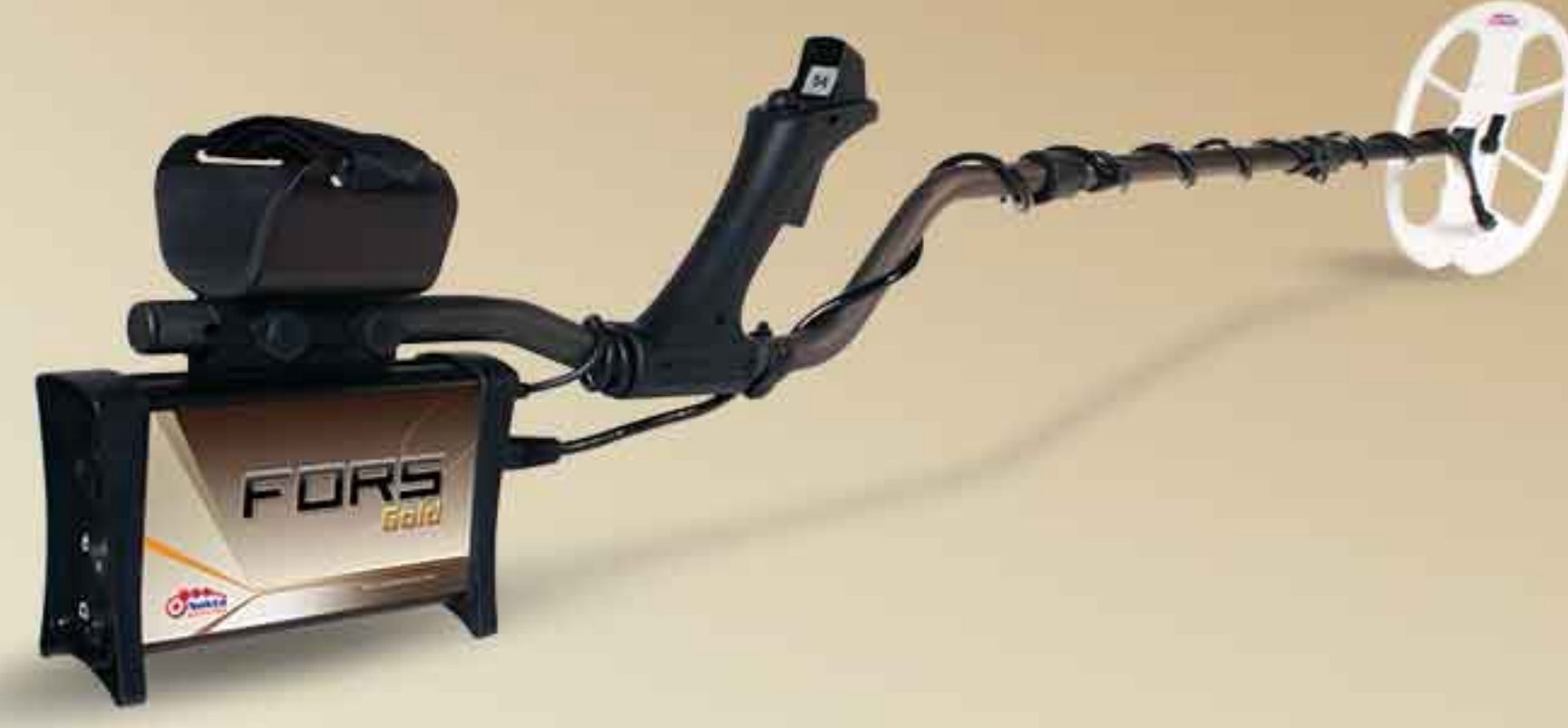
Professional Gold Detector