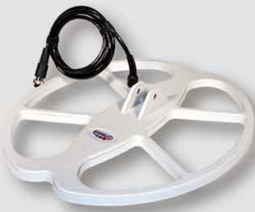
39.5 x 33.7 cm (15.5"x 13.3") DD Search Coil