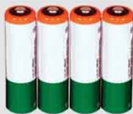
4 AA Rechargeable Batteries