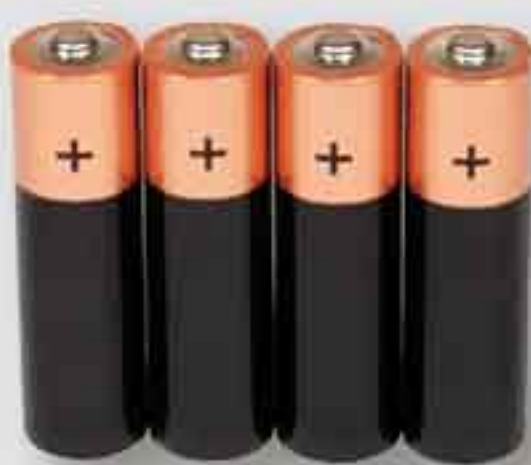
4 AA Alkaline Batteries