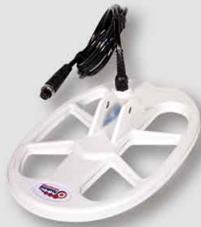
28.5 x 17.8 cm (11.2"x 7.0") DD Search Coil